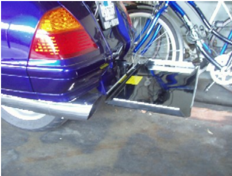
The rack installed and secured with pin.