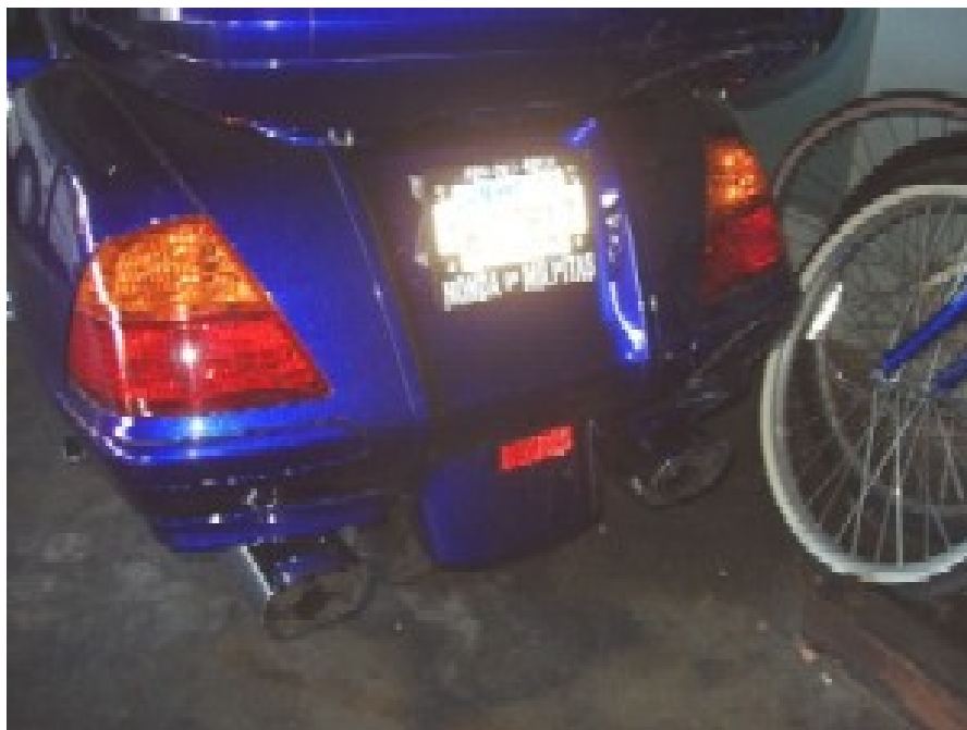
First, with the reflector still on the bike and no rack.

The Pakit Rak was the first major accessory we purchased for our Gold Wing, and by far it has been the most valuable. The folks at Dixon Y Machine have done themselves and the Gold Wing community proud! It's been a great way to avoid having to pull a trailer and deal with the riding restrictions that trailers offer.