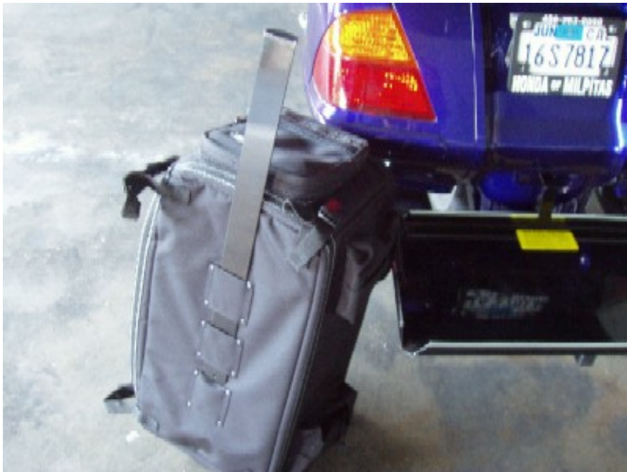
The pack with the securing bar...