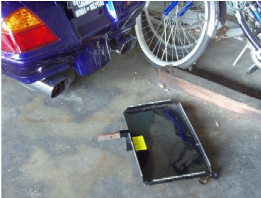
The rack is ready to be inserted into the receptacle.